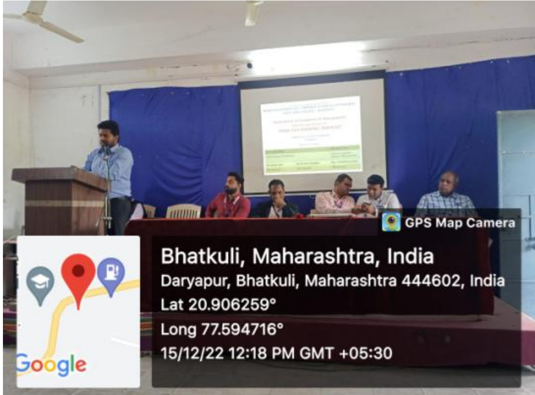
Interaction with State Bank of India Team Members